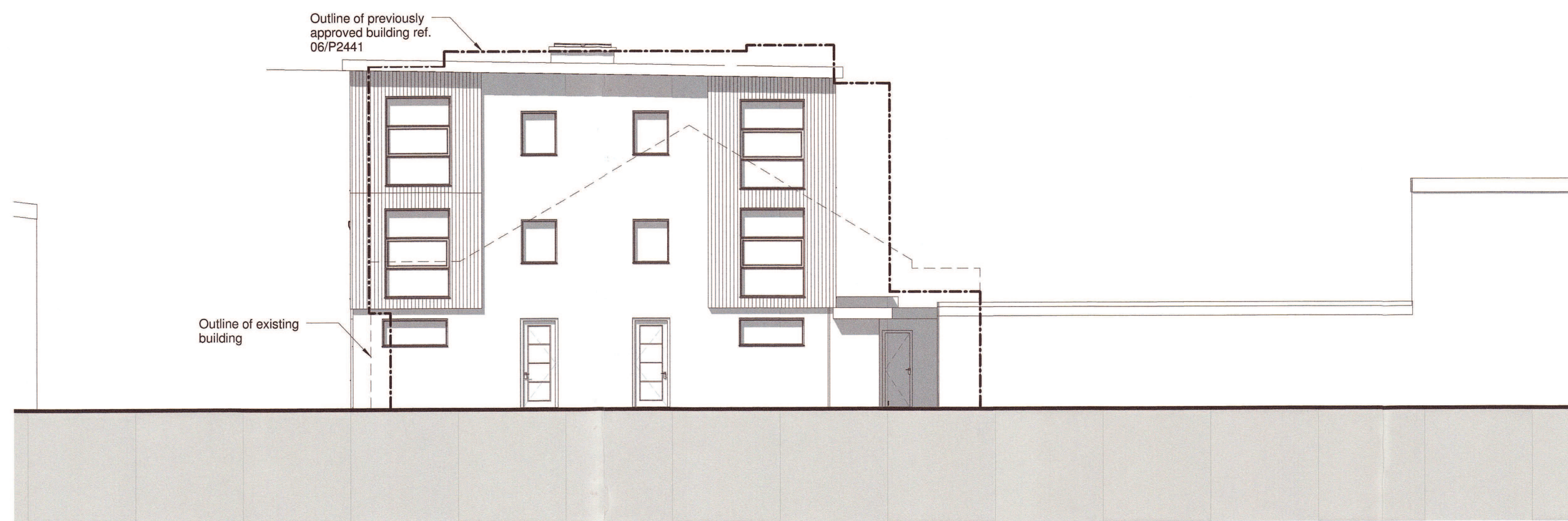
2 South East Elevation 1:100