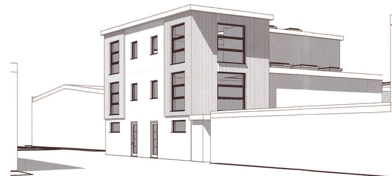
4 View From Elm Grove